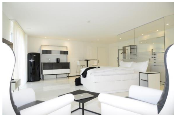
homeSUITE with in-room kitchen, 44-46 m 2