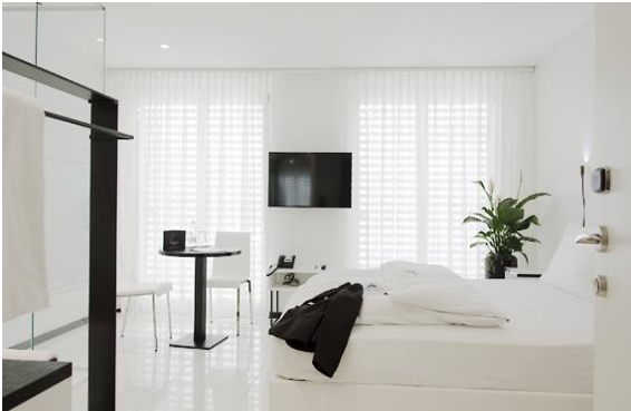
homeSTUDIO without kitchen, with use of loft kitchen 25 m 2

Studios and comfort studios are without in-room kitchen, the sophie's LIVING-KITCHEN is the meeting point for all sociable guests staying with us.