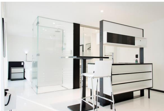
homeAPARTMENT with in-room kitchen, 33-39 m 2