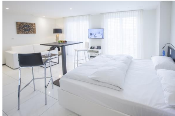
homeCOMFORT-STUDIO without kitchen, with use of loft kitchen, 30 m 2